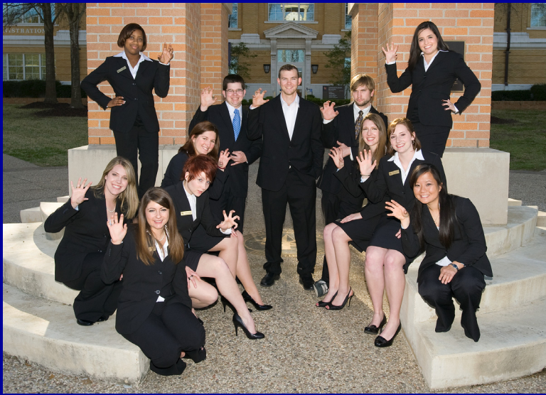
Honors Ambassadors Showing Bearkat Sprit

The Honors Ambassadors is an elite group of enthusiastic and involved honors students who represent the highest ideals of the university. Through leadership and service, the Ambassadors sponsor special events that support and enhance the honors community at SHSU. They serve as official representatives of the Honors College at SHSU events. These include Saturdays at Sam, the High School Honors Dinner, Summer Orientation, and Let's Talk. They also mentor new students, organize the undergraduate research symposium, and assist in recruiting honors students.